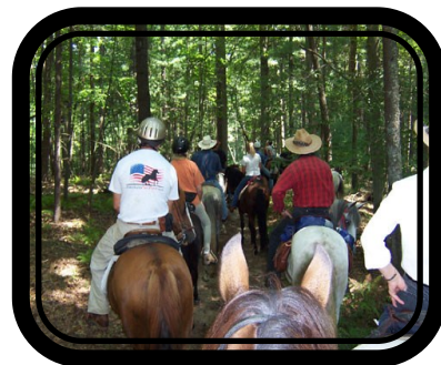
* This image was cloned from the Piedmont PFHA Website.