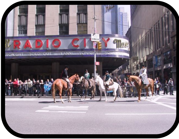
Tartan Day Parade in NYC. What a Landmark!

Remember those Hunter riders dressed in red and black that would ride and jump cross country trails? Well now there is something called Hunter Paces and Trail Paces that are getting popular in the horse country of New Jersey. John and Susan participated in one of these. There are some really nice