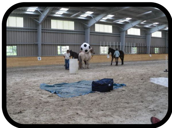
Tor and Zorro at a De Spook Clinic: The soccer ball is almost the size of Tor!

formation. Can't you just see our smooth gaited and smart horses excelling at this?