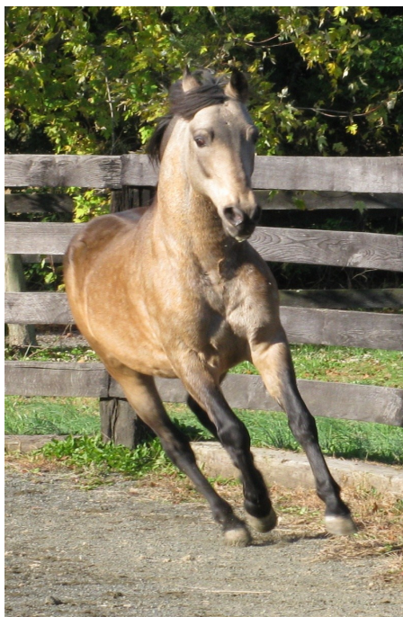
Hacienda Radiante's fino stallion, Laberinto de la Luisa, enjoys some liberty time

mind. We imprint all our babies and handle them regularly so they have good manners. Horses are a luxury and we strive to create horses that people want to be around."