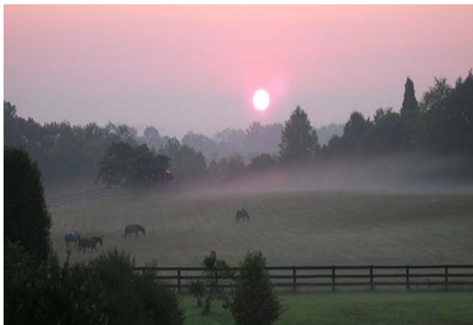
A spectacular sunrise over the broodmare pasture at Hacienda Radiante