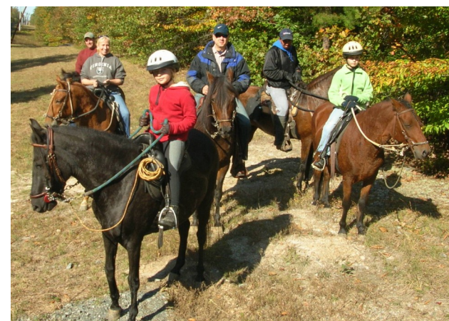
Hacienda Radiante and friends on the trail at Lake Anna (VA) in October