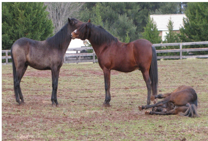
Hacienda Radiante's senior stallion, Juan Miguel del Prado (standing, right) has a semi-retirement job keeping the colts in line in the 'Frat House' paddock

Hacienda Radiante's training facilities include an outdoor arena, covered and open roundpens and 16 stalls, some with private paddocks. An indoor arena is planned. Clients range from trail-riders who are bringing their buddies in for a spring tune-up to Amateur Owners who want to compete at both the regional and national level. The farm specializes in Youth and Amateur riders and boasts several National champions in the Pleasure Division, but never forgets its trail-riding roots, and in the off-season will frequently shanghai willing victims for trail-rides and breed demos. Nearly every weekend you will