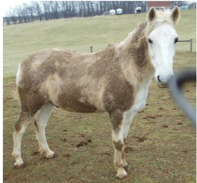
Horse of a different color!